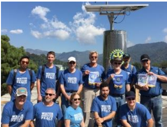
Sun Spring Water Filtration at San Lucas Hospital

We have supported a diverse number of projects, from wheelchairs to a fire engine to a trade school.